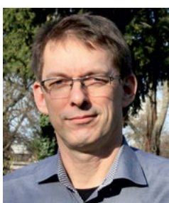
Chair of Soil Science and Geoecology, University of Potsdam