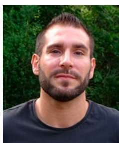
Scientific assistant, Karlsruher Institut of Technology KIT

The working group combines ecological, biogeochemical and environmental physical process understanding to research environmental systems. Particular attention is paid to human-environment interactions, because anthropogenic activities determine the functionality of ecosystems, which in turn largely determines human health. Therefore, our research activities are strongly interdisciplinary and oriented at the interfaces of the compartments pedosphere, hydrosphere, atmosphere and biosphere. Specialized fields of work deal with soil formation and site ecology, soil and sediment mineralogy and chemistry, aerosol mineralogy and chemistry, aquatic biogeochemistry or hydro-